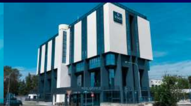
RMH Modena Raffaello Hotel Strada Cognento 5, 41126, Modena