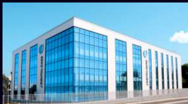
JDentalCare Training Center Via Dino Campana 2, 41123, Modena