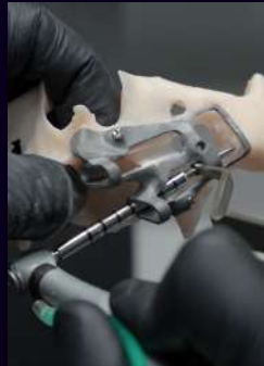
HANDS-ON Z-GO GUIDE™