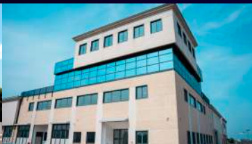
JD Milling Center Via Guido Cavani 60, 41123, Modena