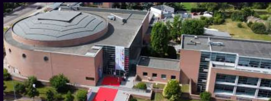
Forum Monzani Centro Congressi Via Aristotele 33, 41126, Modena

The 20 TH June from 7 PM stay with us for JD Aperitif